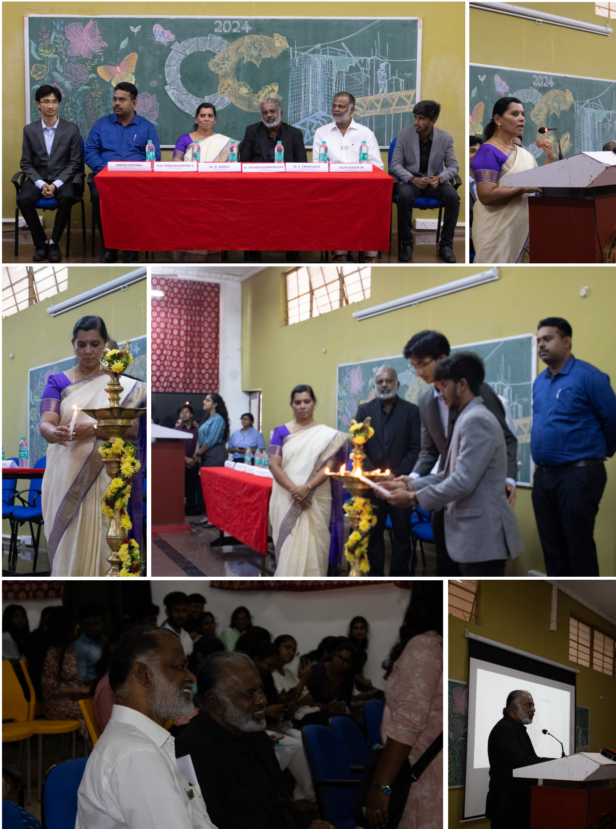
DAY 01 | Inauguration