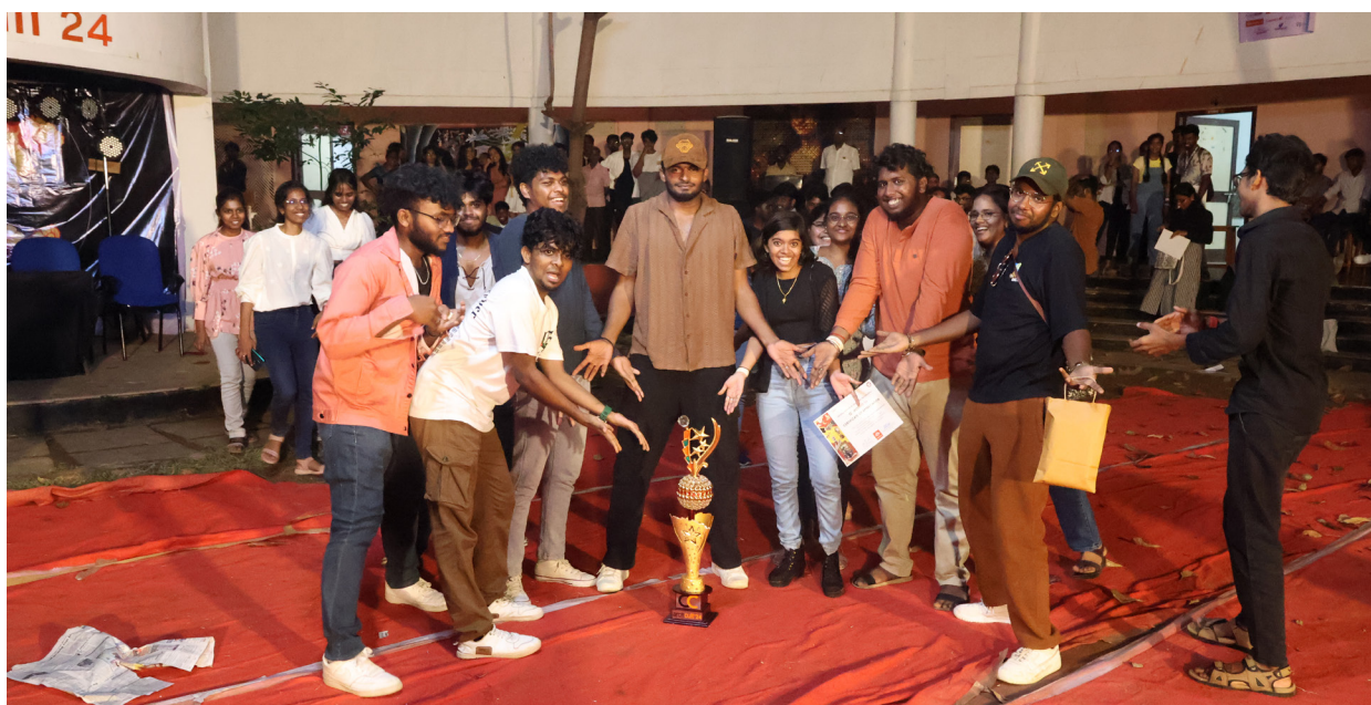
DAY 03 | Highlights