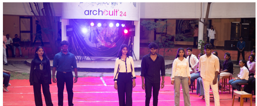
DAY 01 | Highlights